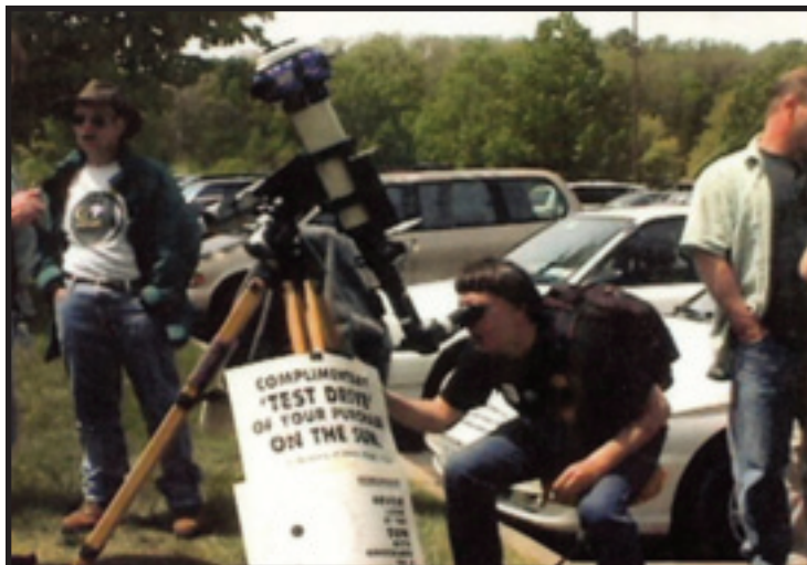
NEAF Chairman pauses for a solar view during NSSP 2006.