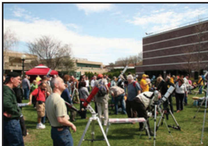
Crowds of NEAF attendees enjoying NSSP 2005.

up my new Tele Vue solar scope in the parking lot across from the long line of attendees leading to the TV sale tent and placed a large sign on the front of my scope advertising, “Complimentary test drive of your NEAF purchase on the Sun,” and during these early years many NEAF attendees got their first views through their new TV eyepieces in my solar telescope. Better yet, I got free test drives of a wide variety of great eyepieces.